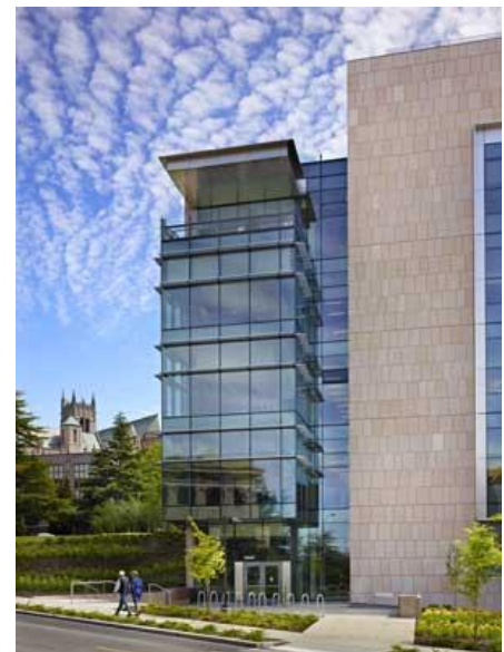
Mol. ES Building